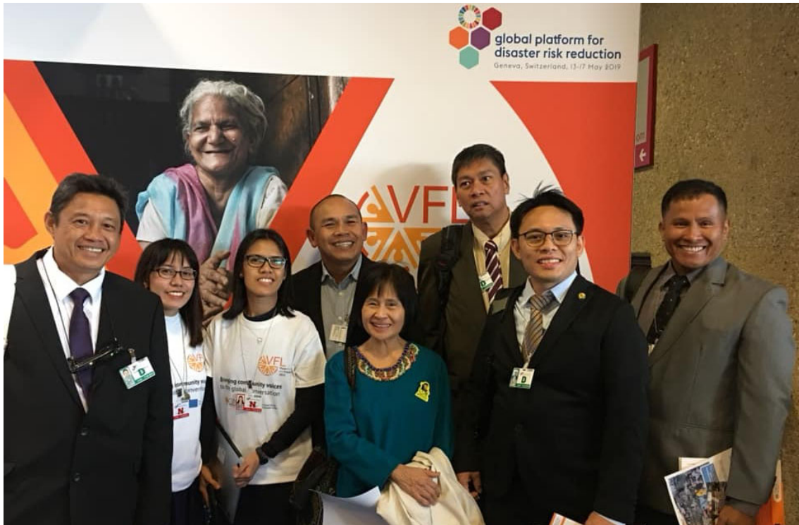
Global Platform for Disaster Risk Reduction, Geneva, May 13–17, 2019.