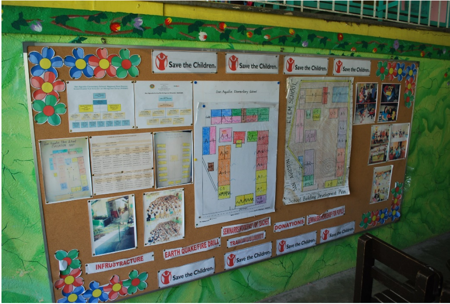
Figure 1. School-based and child-centred disaster risk reduction plan in Hagonoy, Jan. 2014.