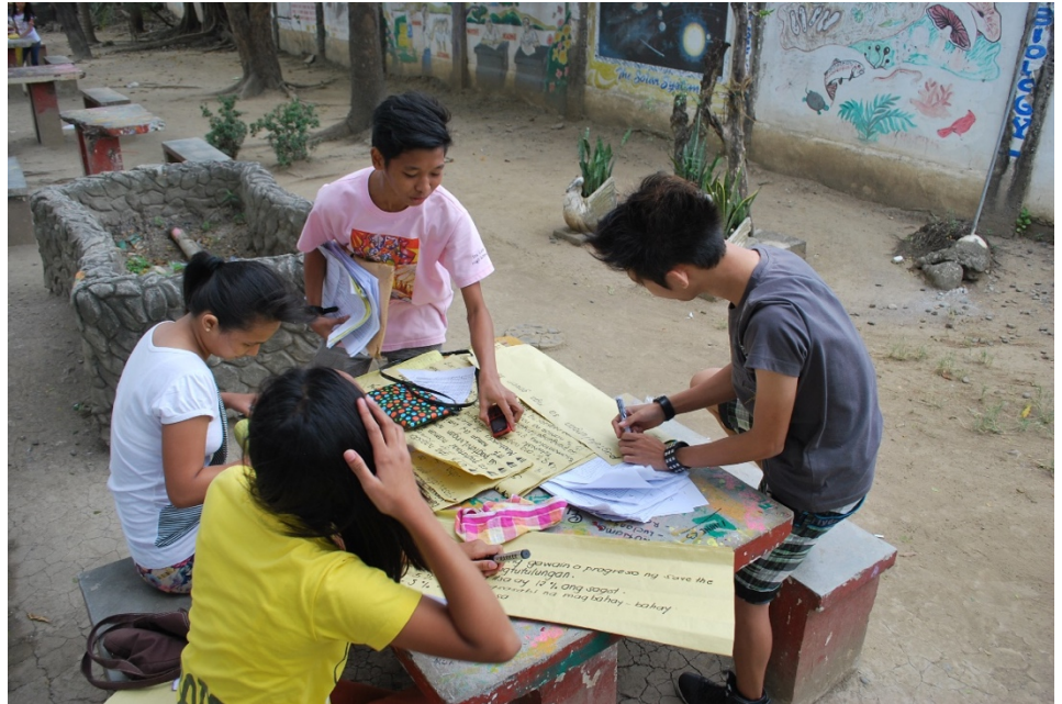
Figure 3. Children leading the analysis of the participatory survey data in Calumpit, Jan. 2014.