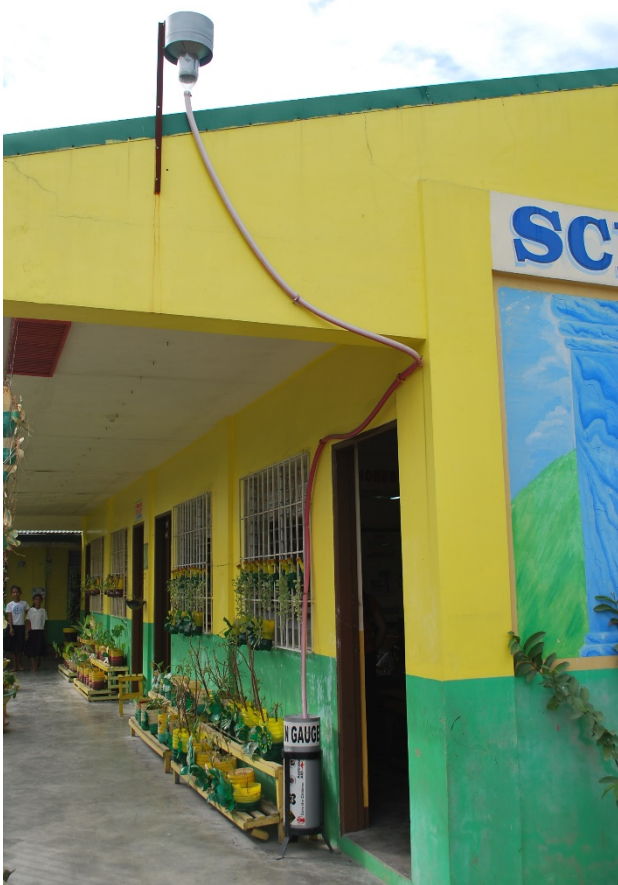
Figure 2. School-based flood early warning system in Calumpit, Jan. 2014.